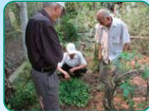
(Thaibinh Medical University)