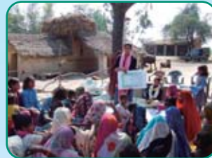
(ASHA = Asian Sustainable Holistic Approach)