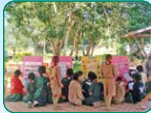
(Terra People Act Kanagawa)