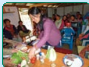
(Miyazaki International Volunteer Center)